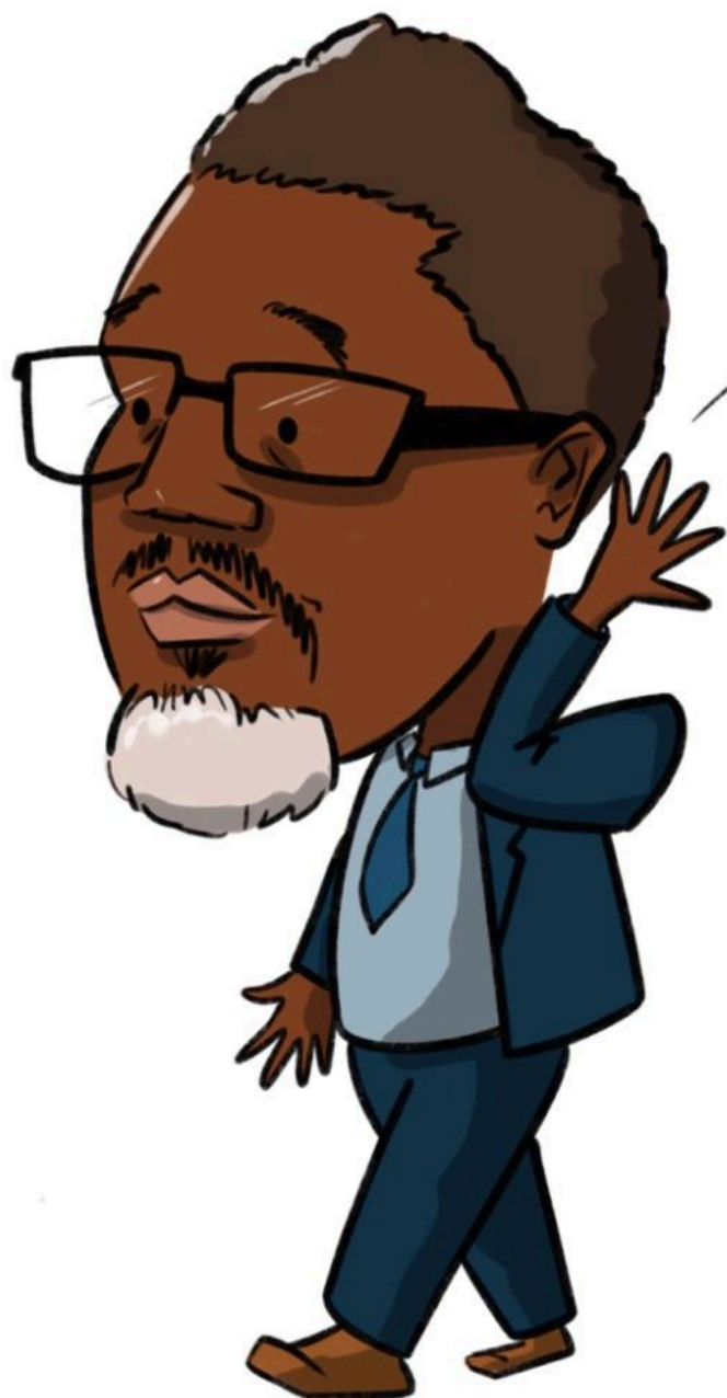
YU YU BLUE | THE DEPAULIA